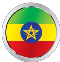
ETHIOPIA Oil & Gas Industry