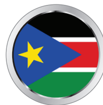
SOUTH SUDAN NGO